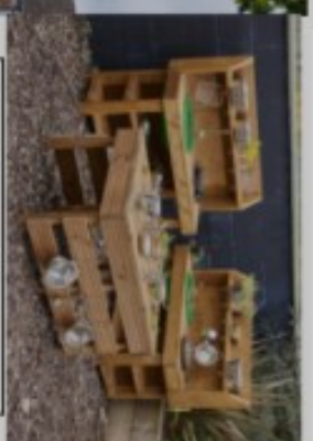
CosyDirect – Mud Kitchen Complete Set