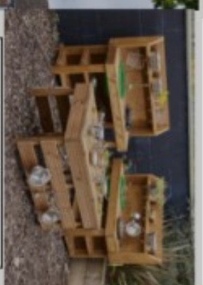
CosyDirect – Mud Kitchen Complete Set