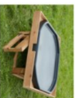
CosyDirect – Tuff Tray Storage Stand