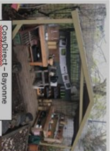
CosyDirect – Bayonne Big Barn