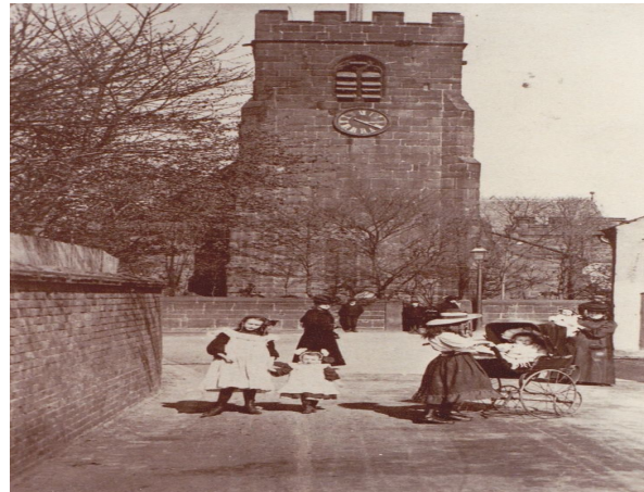
St Luke's Church is the oldest church in Widnes. It was built around 1180 and used to be called St Wilfred's.

The furnace on the crest relates to the form of industry for which Widnes was noted for, namely alkali and soap manufacture.