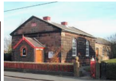
There are three churches in Cronton: Cronton Mission Church, Cronton Methodist Church and Holy Family Church