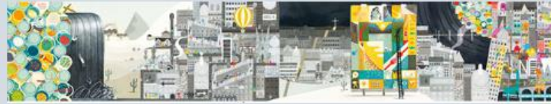
God - Creation - Fall - People of God - Incarnation - GOSPEL - Salvation - KINGDOM OF GOD

Mother Teresa was awarded the Nobel Peace Prize, after dedicating her life to helping others.