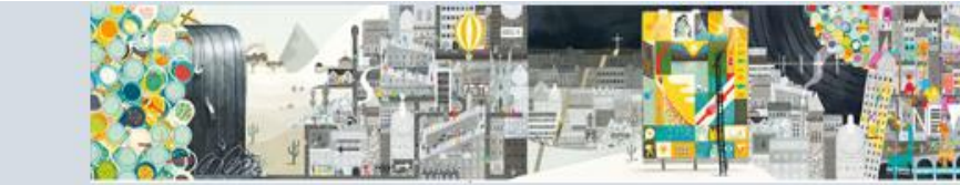
God - Creation - Fall - People of God - Incarnation - Gospel - Salvation - Kingdom of God