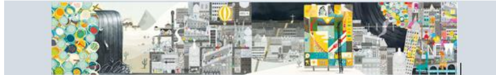
God - Creation - Fall - People of God - INCARNATION - Gospel - SALVATION - Kingdom of God